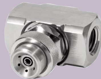
1/4" XAER850A XA 00 Body; A Hardware

Dimensions are approximate. Check with BETE for critical dimension applications.